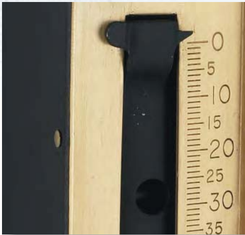
Easy to read graduations