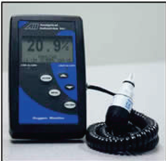
AII-2000 M Oxygen Monitor

Gas analysis solutions through advanced analyzer and sensor technology